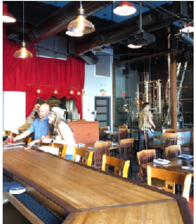
Stillhouse at Zoetropolis, with bowling alley counters and still as part of the decor.