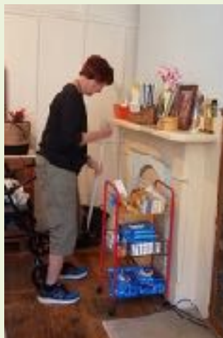
Community volunteering with Meals On Wheels.